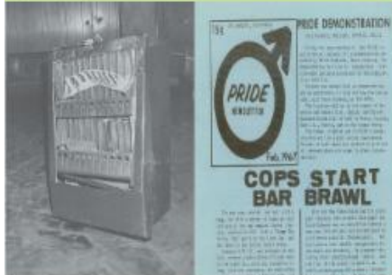
(Top left and bottom left) View of a damaged jukebox and cigarette machine, along with a broken chair, inside the Stonewall Inn (at Christopher Street) after a riot. (Top right) An unidentified group of young people celebrate outside the Stonewall Inn. The bar and surrounding area were the site of a series of demonstrations and riots that led to the formation of the modern gay rights movement in the United States.

These and other protests set the stage for the Stonewall Riots, which were a turning point in LGBTQ history. The riots began at around 2 AM on June 28, 1969 at the Stonewall Inn, a popular gay bar in New York's Greenwich Village. At the time, police departments across the United States routinely conducted raids of gay bars for illegally serving LGBTQ people. It was difficult for gay bars to hold on to liquor licenses because they were considered immoral establishments. Uncalled for ID checks, arrests, and police brutality were commonplace. But by this point, people had had enough.