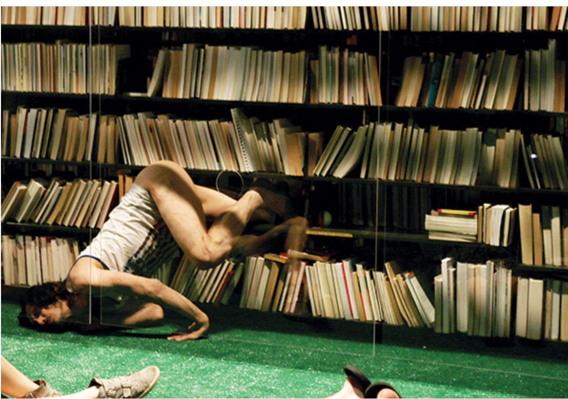
Images: Photograph from Touch of the Other: Performing the Laud Humphreys Papers at ONE Archives at the USC Libraries, April 8, 2015.