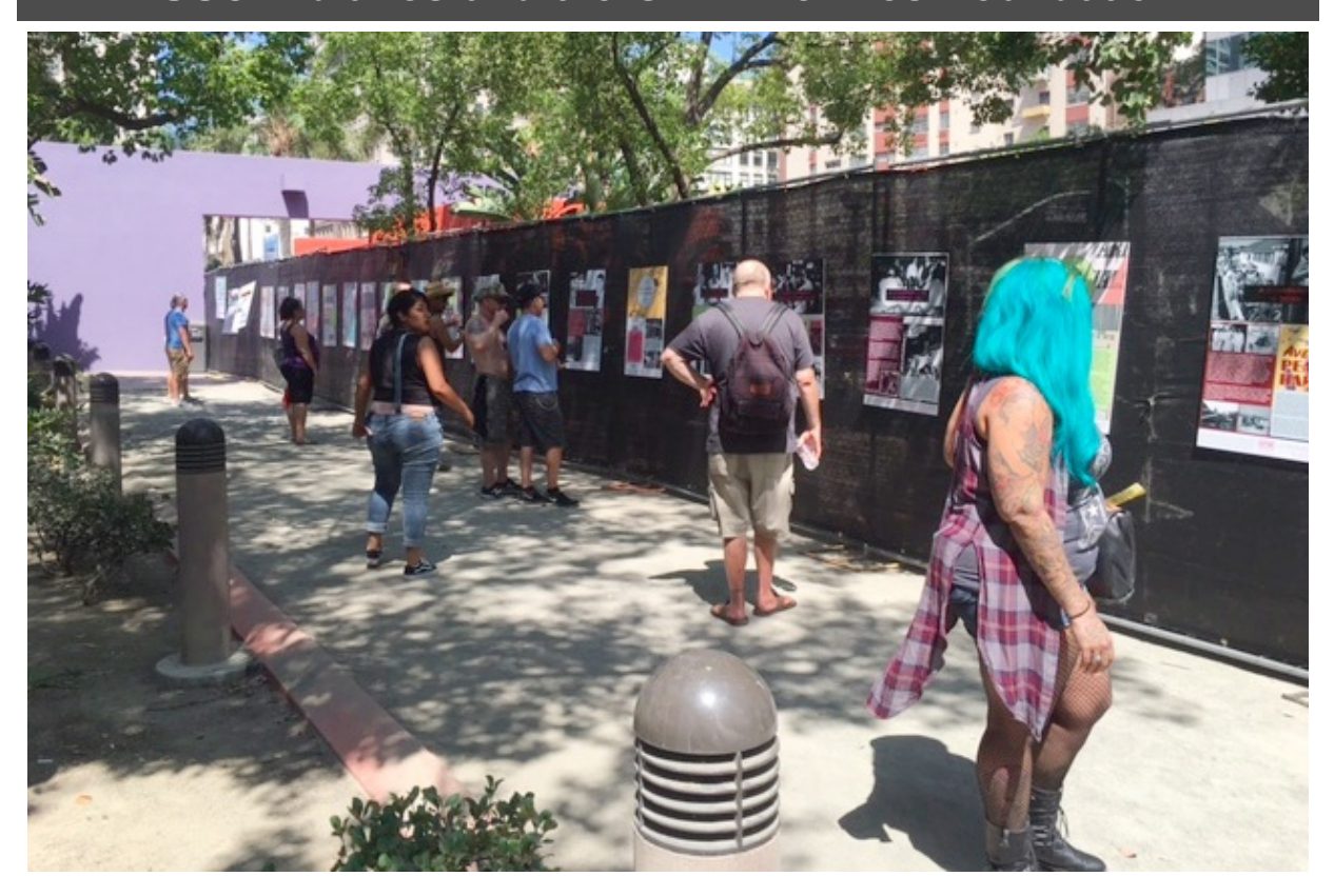
Image of attendees at the DTLA Proud Festival viewing the ONE Archives Foundation LGBTQ History Panels.