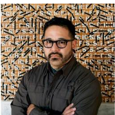
Saturday, February 20, 2016, 4pm Samuel Freeman Gallery 2639 S La Cienega Boulevard