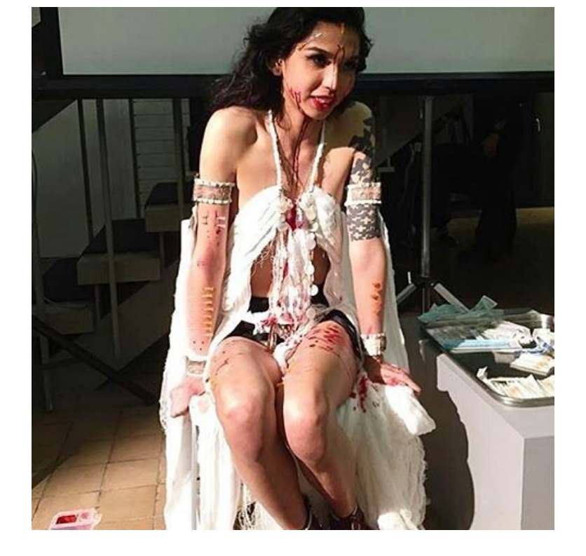
FUCK! Loss, desire, pleasure opening reception(s)

It was perhaps serendipitous that the opening on Friday, January 29 coincided with the two day conference Live Artists Live: Performance Art and the Archive , given the centrality of the human body and extreme performance at the club known as FUCK!. The soft opening was well attended largely by scholars with an interest in performance as well as major figures like Ulay accompanied by widely read theorist Amelia Jones , known for her work elaborating a queer, anti-racist, feminist history and theory.