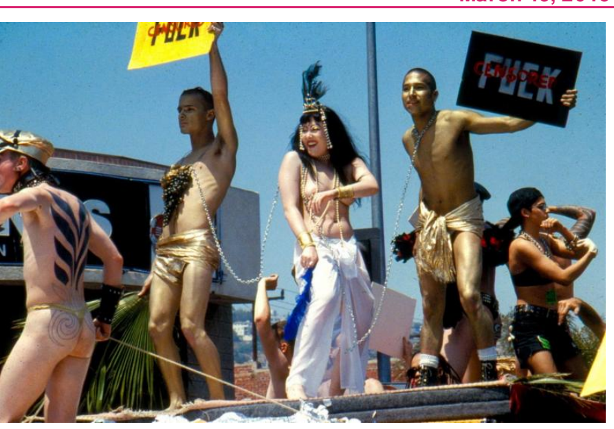
Friday, January 29 - Saturday, March 19, 2016 ONE National Gay & Lesbian Archives