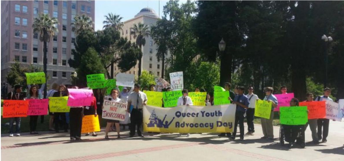
ONE Archives gave a LGBTQ History presentation at a GSA's Queer Youth Advocacy Day in Sacramento