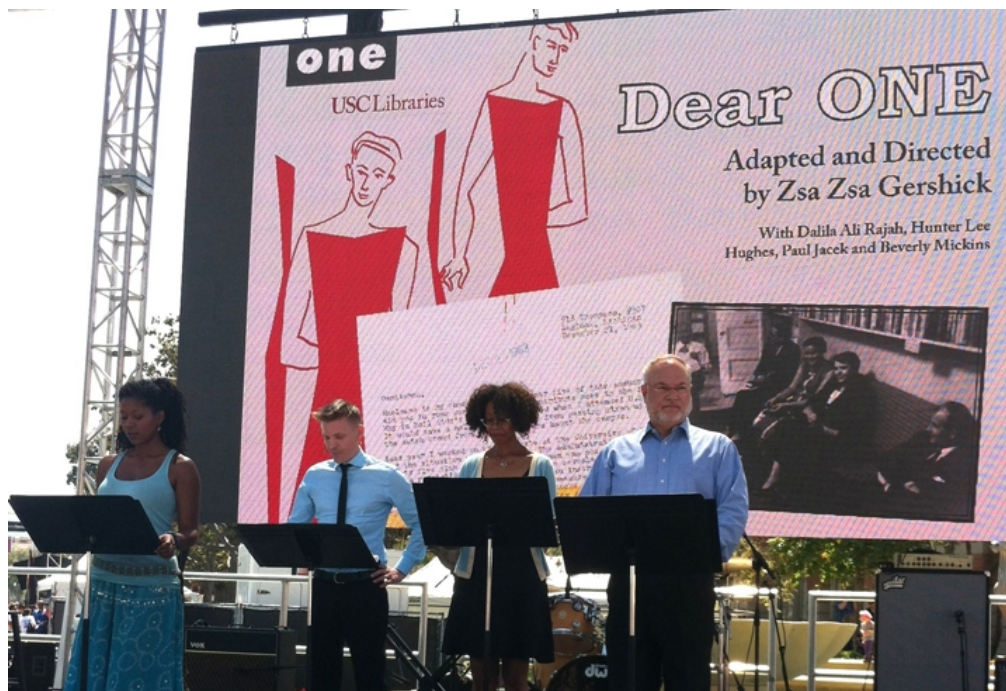
Dear ONE at the LA Times Festival of Books