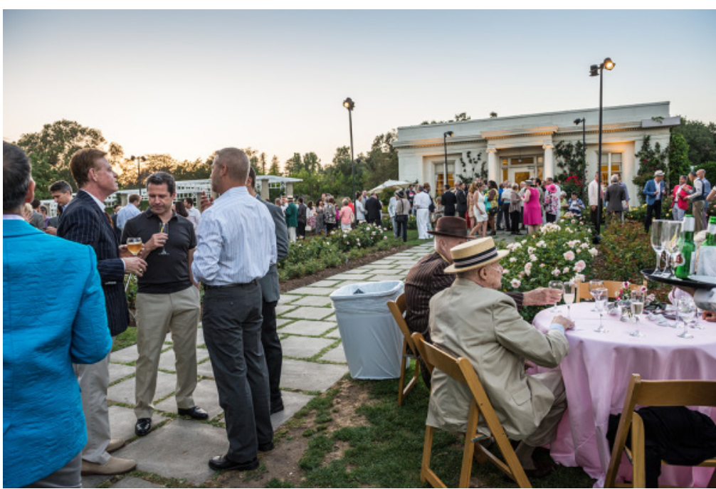
Attendees enjoying the garden party.

On Friday, June 6, 2014, to kick-off L.A. Pride weekend, The Huntington Library hosted An Evening Among the Roses: A Celebration of the LGBT Community . ONE provided sponsorship support for this fun and elegant garden party which celebrated the important contributions to The Huntington by the LGBT community. The evening's honoree was Don Bachardy, renowned American portrait artist and life partner of author Christopher Isherwood.