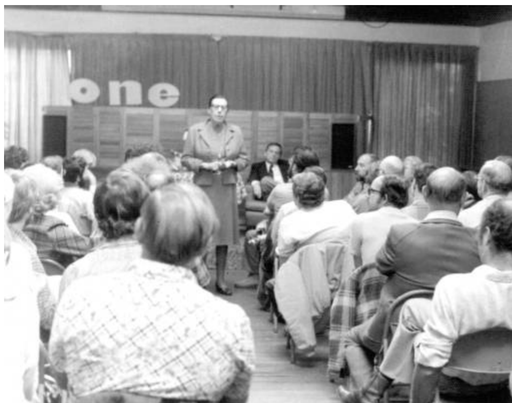
Noted psychologist, Dr. Evelyn Hooker, speaks at ONE Incorporated. April 2, 1978.

200 Hours of Audio Recordings from ONE Now Accessible Online