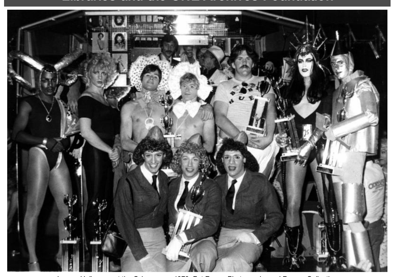
Image: Halloween at the Odyssey, c. 1979.