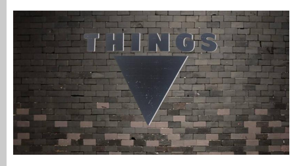
THINGS: a queer legacy of graphic art and play