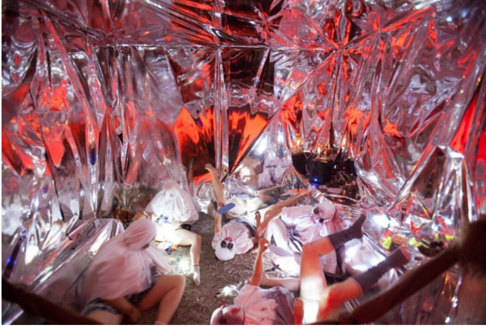
Images: Installation photographs from prior installation of KillJoy's Kastle in Toronto, October 2013.