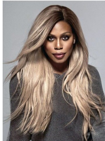
LAVERNE COX Role: Dr. Emma Brookner