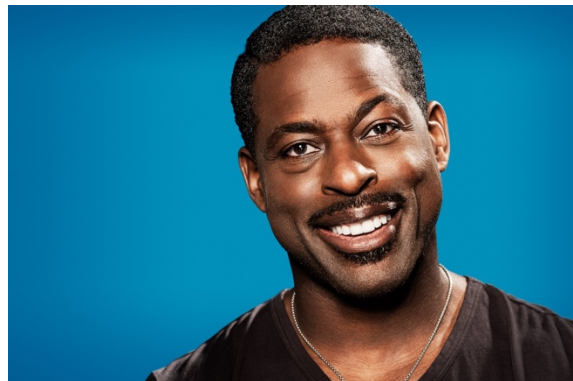
STERLING K. BROWN Role: Ned Weeks