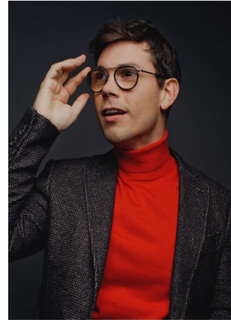
RYAN O'CONNELL Role: Craig Donner / Grady