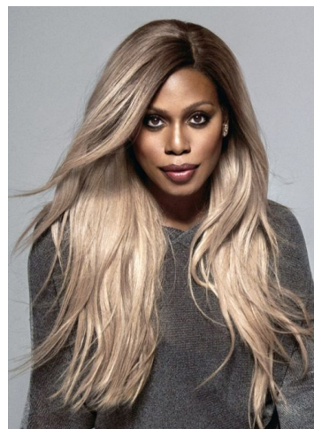
LAVERNE COX Role: Dr. Emma Brookner