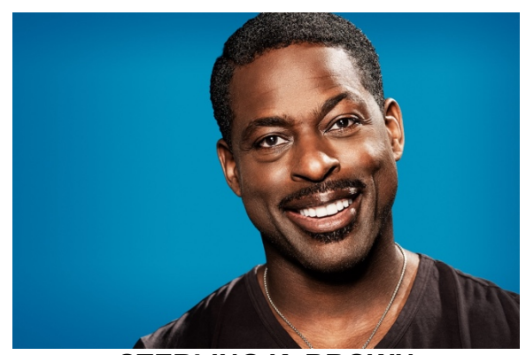
STERLING K. BROWN Role: Ned Weeks