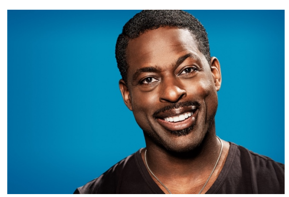
STERLING K. BROWN Role: Ned Weeks