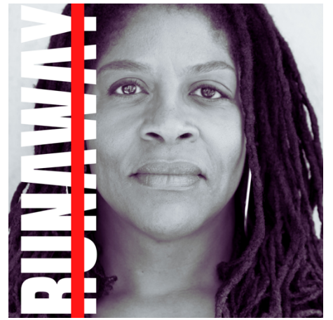
Close-up Thumbnail for Runaway by Imani Tolliver