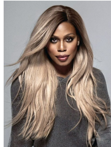
LAVERNE COX Role: Dr. Emma Brookner