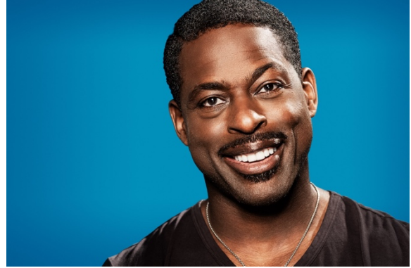
STERLING K. BROWN Role: Ned Weeks