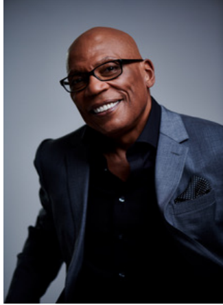
PARIS BARCLAY Director and Narrator