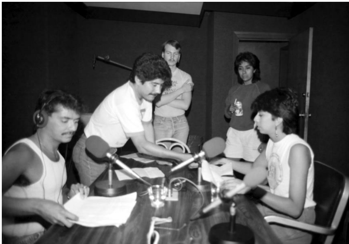
Together On the Air Press Release – 3.16.2023